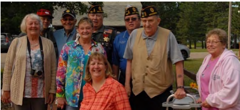
Members of Post 435 Family who attended the ceremony