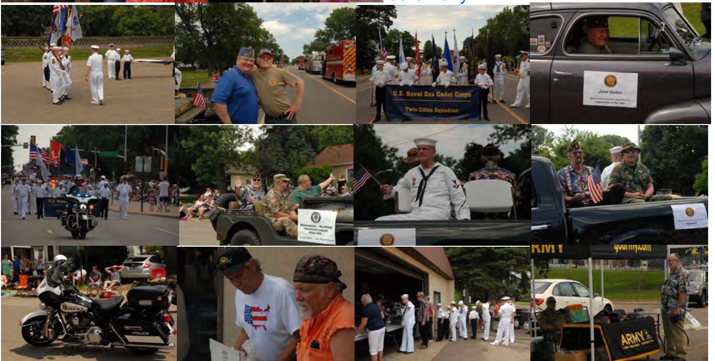
July 4th Independence Day Celebration